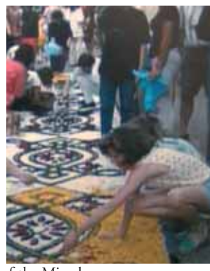
Colorful displays in honor of the Miracle