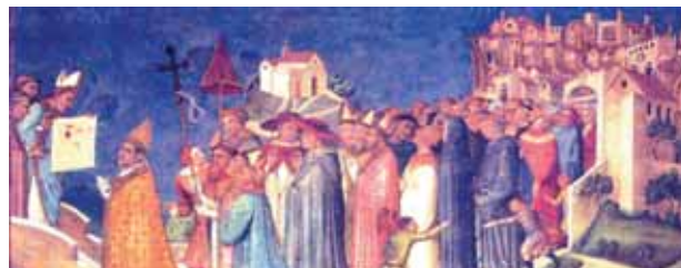
The Procession over the Riochiaro Bridge, (artist : Ugolino d'Ilario). Orvieto Cathedral