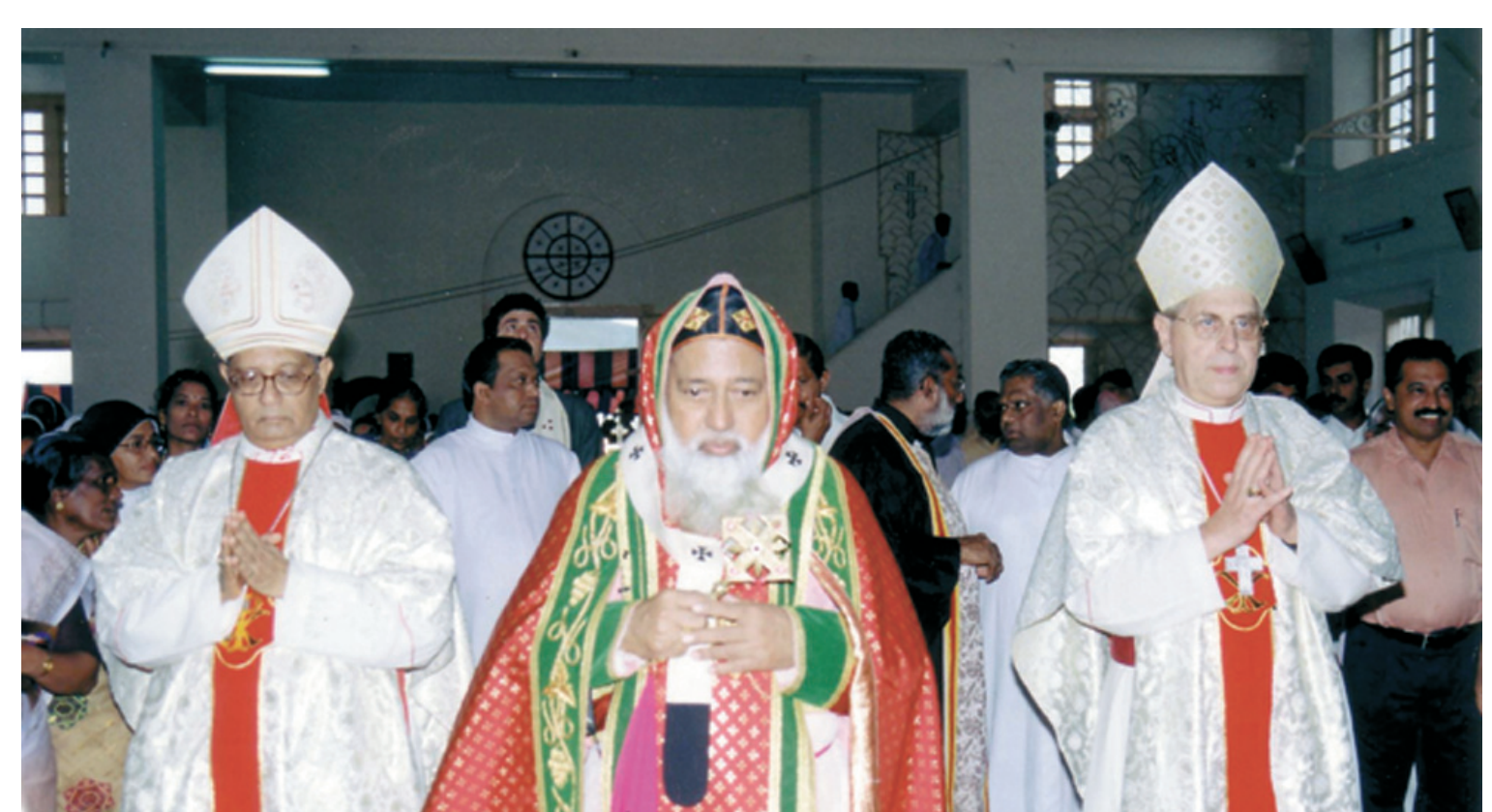
His Beatitude Cyril Mar Baselice, Archbishop of the diocese of Trivandrum

celebrations. I vested for Mass and went to open the tabernacle to see what had happened to the Eucharist in the monstrance. I immediately noted in the Host, a figure, to the likeness of a human face. I was deeply moved and asked the faithful to kneel and begin praying. I thought I alone could see the face so I asked the altar server what he noticed in the monstrance. He answered: 'I see the figure of a man.' I noticed that the rest of the faithful were looking intently at the monstrance.