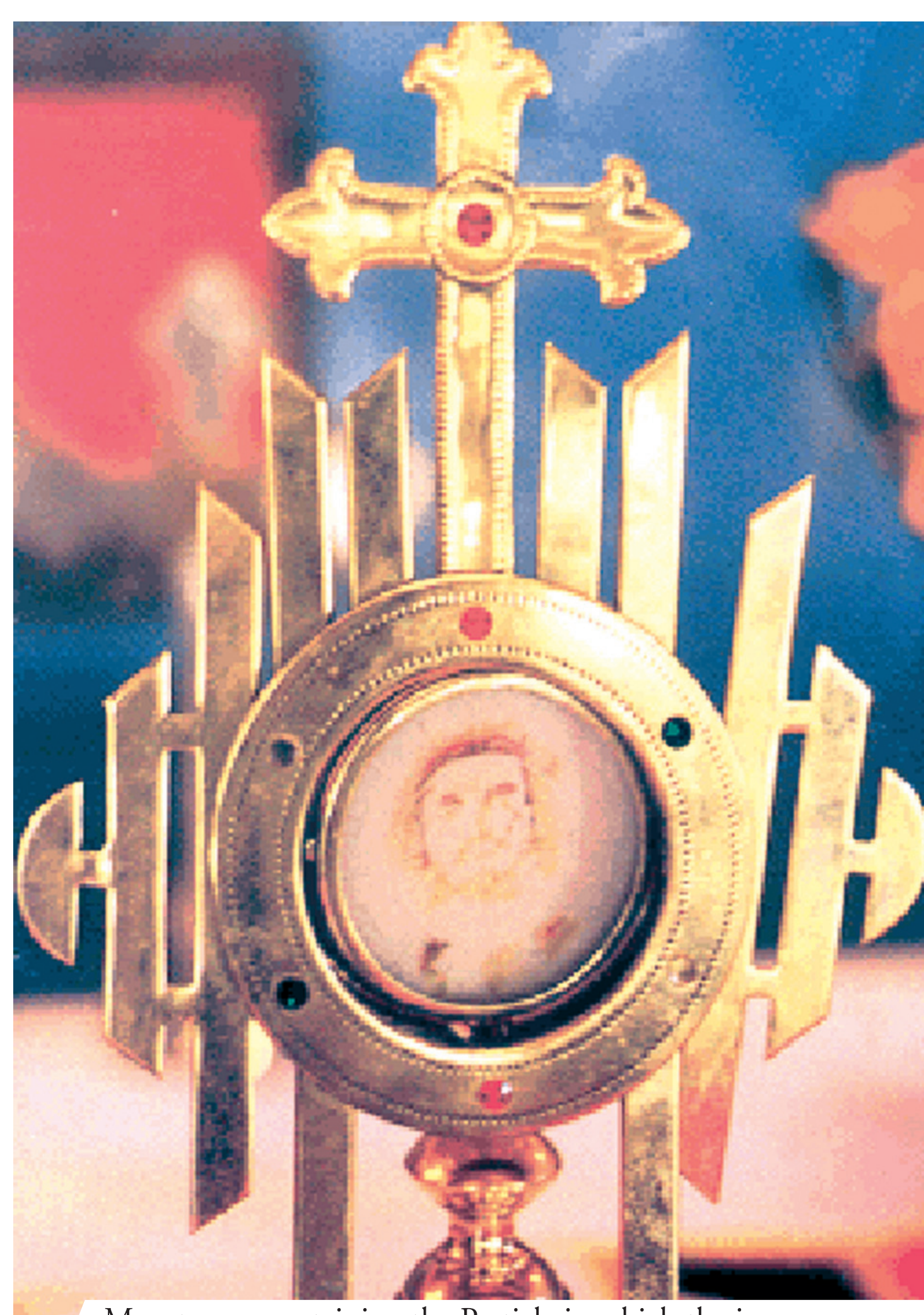
Monstrance containing the Particle in which the image appeared